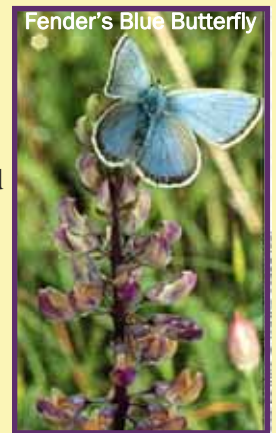
Fender's Blue Butterfly