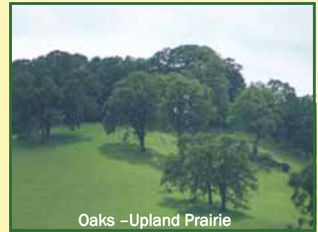
Oaks -Upland Prairie